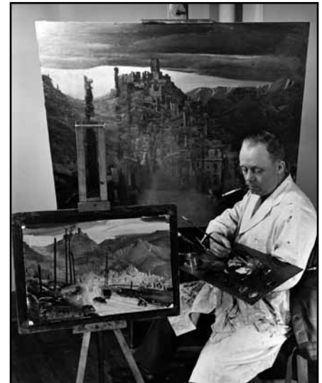
Canadian War Museum 20040082-028