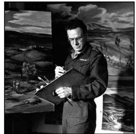
Malak, Campbell Tinning, 1946, published in "Road to Victory: Army Artists' Canvases Record the Long and Bloody March from Camp Borden to Berlin," Montreal Standard , 25 May 1946). This is not the actual published image, which is too poor to be reproduced, but a reconstruction made especially for this article.

significant 1946 exhibition was the reason for the photo story on the Canadian war artists. Malak's photographs also became part of that history. In print, these complex photographs were provided with captions and short notes about the artists, where they had served with the military, their artistic background, and biographies. But they were also cropped thus removing Malak's creativity in favour of the traditional head shot. Was this alteration of his work perhaps one more reason why he abandoned portrait photography?