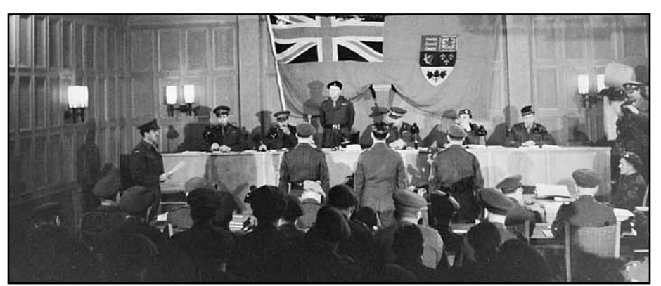
PA 140575

Astonishingly, only the editorialist for the London Free Press commented upon Meyer's death sentence in the days following its announcement. He too had noticed the lack of editorial response, the result, he suggested, of the outcome being a foregone conclusion.<sup>17</sup> The editor, nevertheless, argued that Meyer's conviction represented an important victory for justice. Noting that perpetrators of war crimes received much harsher penalties in the aftermath of the latest war than they had in the First World War, he