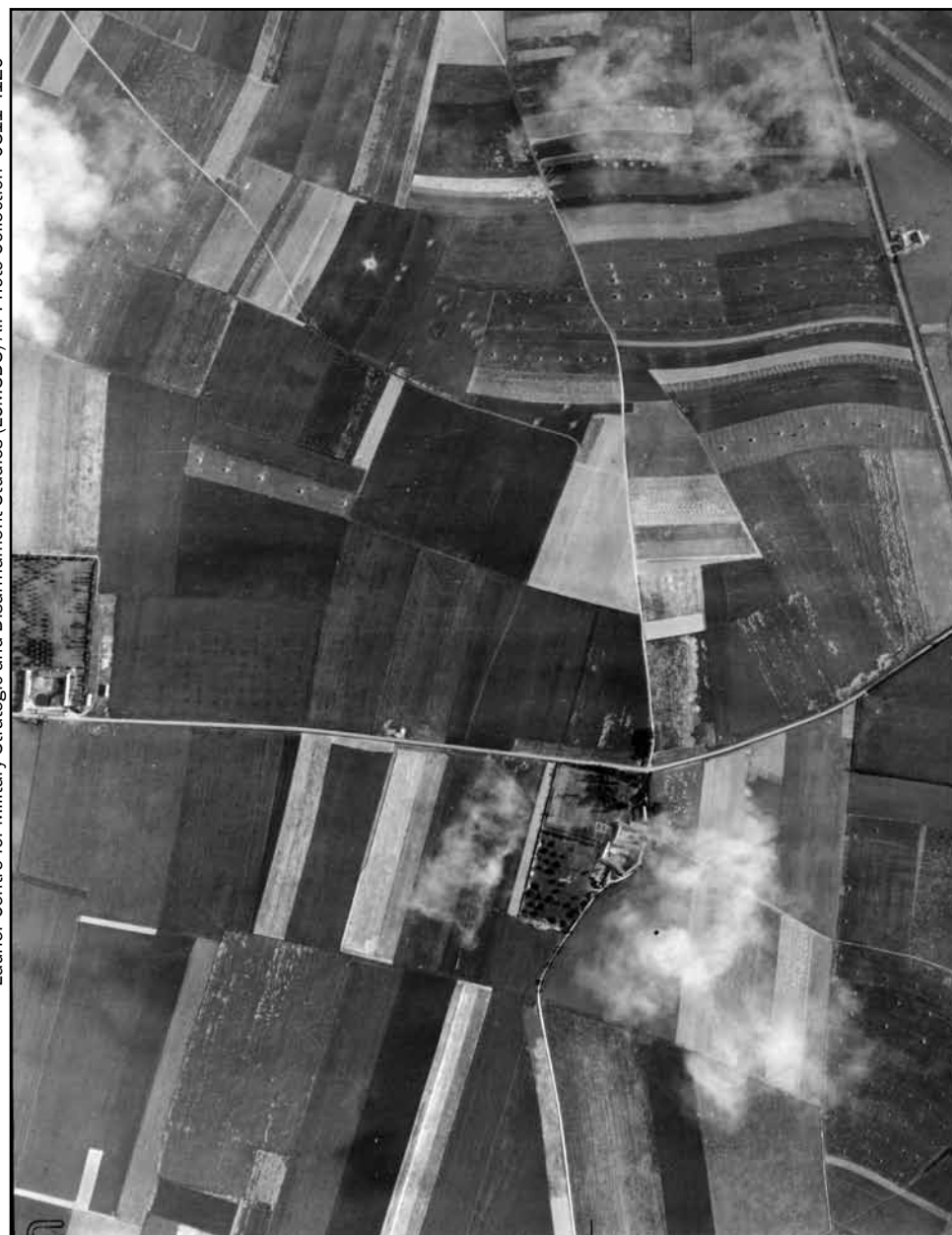
Laurier Centre for Military Strategic and Disarmament Studies (LCMSDS) Air Photo Collection 0311-41:20

This air photograph of Troteval and Beauvoir Farms was taken on 9 July 1944 before the area saw much fighting. The start line for the FMR attack was in the top left corner of the photograph.