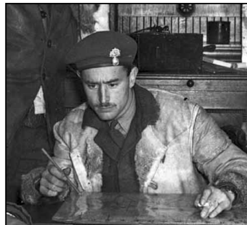
Lieutenant-Colonel Jacques Dextraze examines a map prior to an operation late in the war when he commanded the Fusiliers Mont-Royal.

The enemy of course did not occupy the farm but had light machine guns in the corners of the orchard. He was outside in the fields when our shells came down, apparently caught unexpectedly. He never thought we were so close. The garden and orchard had snipers and they were out in the fields as well. We found slit trenches inside the walls and outside. Machine gun posts were