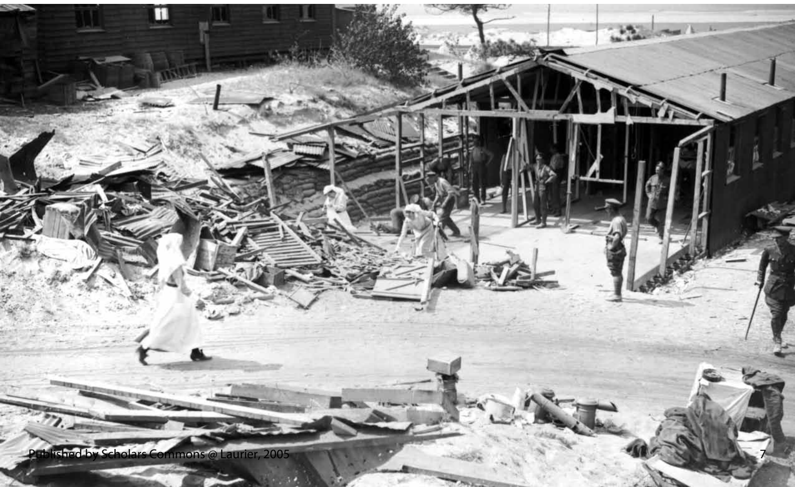
Canadian Nursing Sisters working amongst the ruins of the No.1 Canadian General Hospital, which was bombed by the Germans, killing three nurses, June 1918.

When preparing the recommendation for a gallantry award, normal practice asked submitting officers to designate the appropriate award. As the Canadian nursing sisters were officers with the relative rank of lieutenant, it therefore seemed clear to the Canadian authorities in France that they should make out the recommendation for