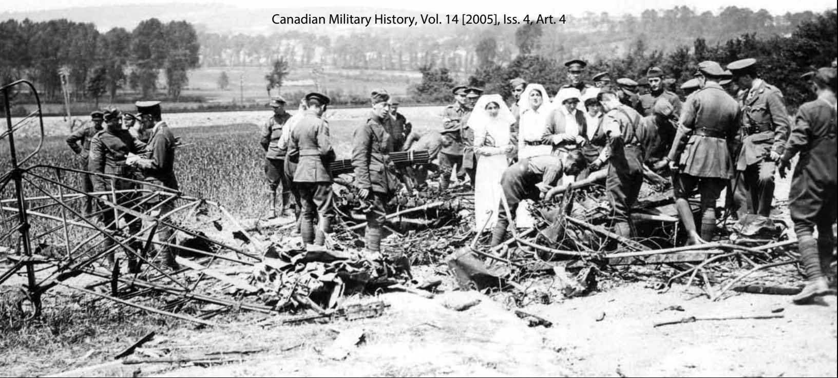
Above: Nursing sister survey the remains of German bomber, shot down near their hospital.