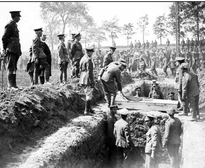
Below: Funeral of Canadian Nursing Sister and one American doctor killed in bombing raid on No.3 Canadian Stationary Hospital, Doullens, France, 30/31 May 1918.