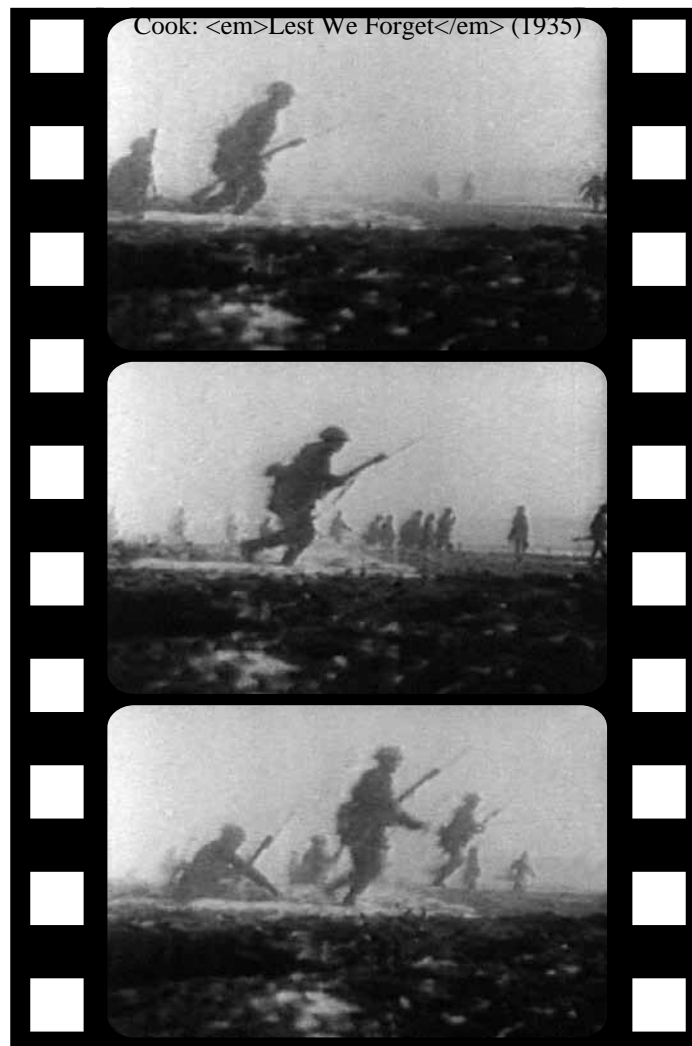
Still images of soldiers leaving a trench captured from the film Lest We Forget .

This night of relived memories became the focus for an intense debate in the media, in Parliament, and among veterans. Lest We Forget was discussed, critiqued, and celebrated over the coming months as it was shown across the country. There was no meta narrative, no uniform discourse: some newspapers and letter-writers saw it as the glorification of war while others found it coloured distastefully by an antiwar fervour; some argued that all citizens of the country should see the film, others thought it too horrific for children, and much too dangerous for the vast unemployed men who might either join