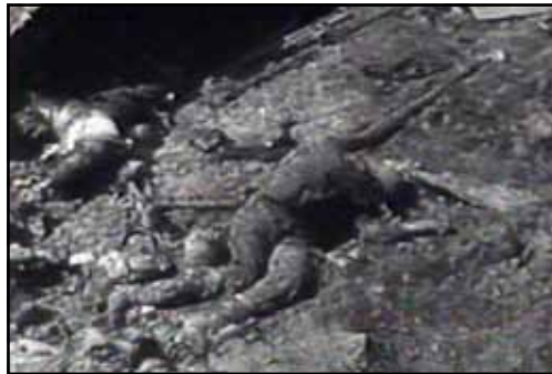
Still image of dead soldiers captured from the film Lest We Forget .

Did it bring to their nostrils the stench of gangrene, the sight of the poor head wounds plucking out their brains with their fingers; the pitiful wrecks of shell-shocks, the death of the tetanus patients?... If this wonderful film really showed the 'stark realities of war' it should show the death of gassed patients....They were terrible deaths to behold. Did any...ever see...death by gas...his protruding eyes and the blood streaming from them, his lolling tongue, his bleeding ears, his terrible rasping gasps, his clutching hands to his throat - ah, they will want the curtain drawn. 70