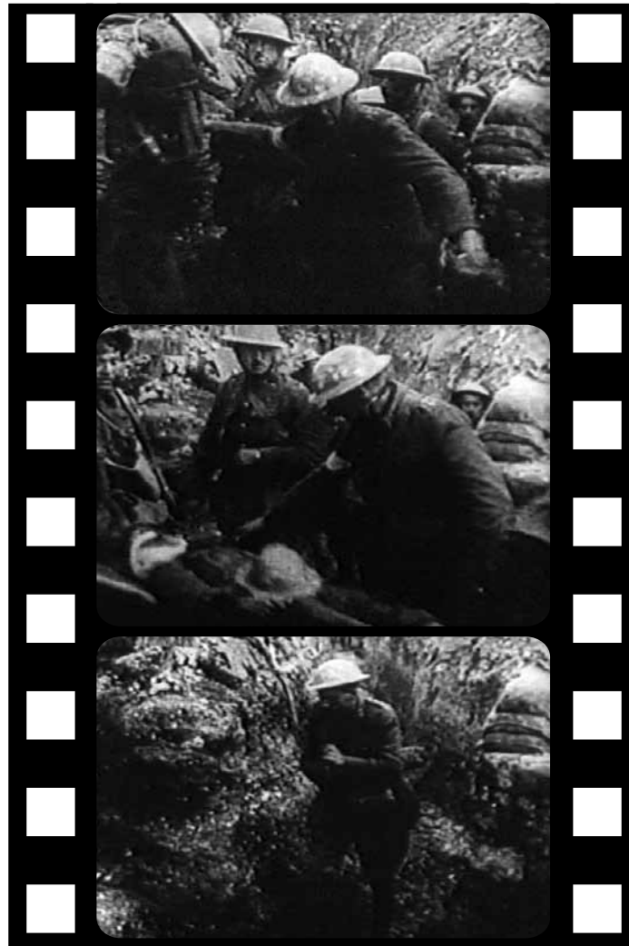
Images of soldiers working in a trench captured from the film Lest We Forget .

The debate engendered by the film moved from the media to the House of Commons and into the Senate chambers. After seeing the movie, the pacifist and leader of the Progressives, J.S. Woodsworth, questioned the yearly allotment of money to the Department of National Defence, and thought the funds could be used, as Lest We Forget had reminded all viewers, he suggested, to find new steps for “world peace.” 64 Senator Jas Murdock evoked the film to address similar questions, and although he believed it provided one of the “finest historical records” of the war, he worried that the scenes of brutality and patriotism might promote dangerous passions in its viewers. Every Canadian over the age of thirty should see the film, he thought, but it would be a “crime against humanity” to show it to “impressionable youth” who might be driven