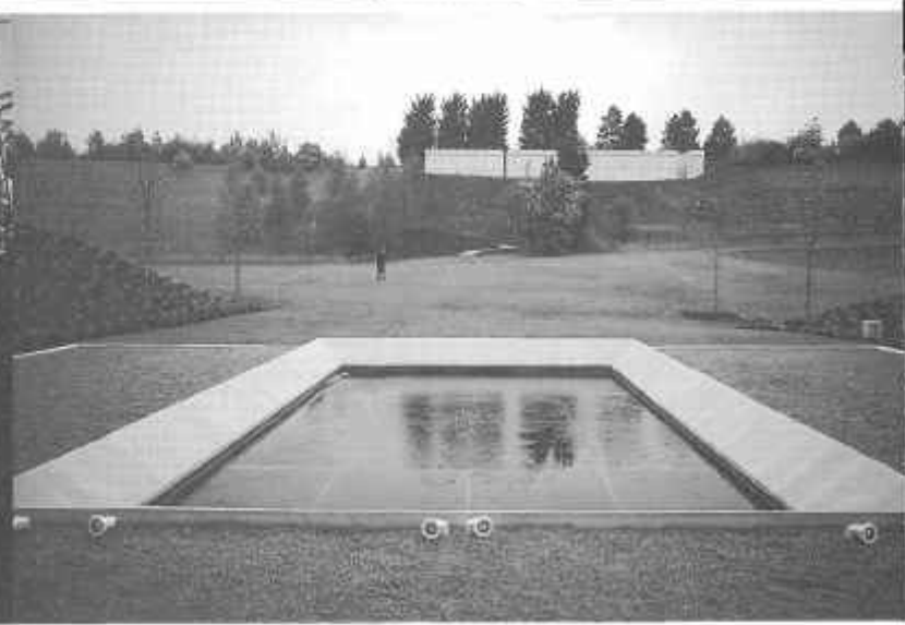
Top left: Caen school children walk down the zig-zag path during the ceremonial opening of the garden in May 1995; Top right: A view of le Mémorial overlooking the fountain; Above left: Glass steles etched with the names of Canadian units which fought in Normandy; Above right: The fountain, looking towards the terrace; Right: The grove as it appeared in the summer of 1998; Bottom: Two views of the terrace showing its forbidding stone structure and the wilderness of thick, spiky prairie grass which hide the zig-zag path which leads up to it.