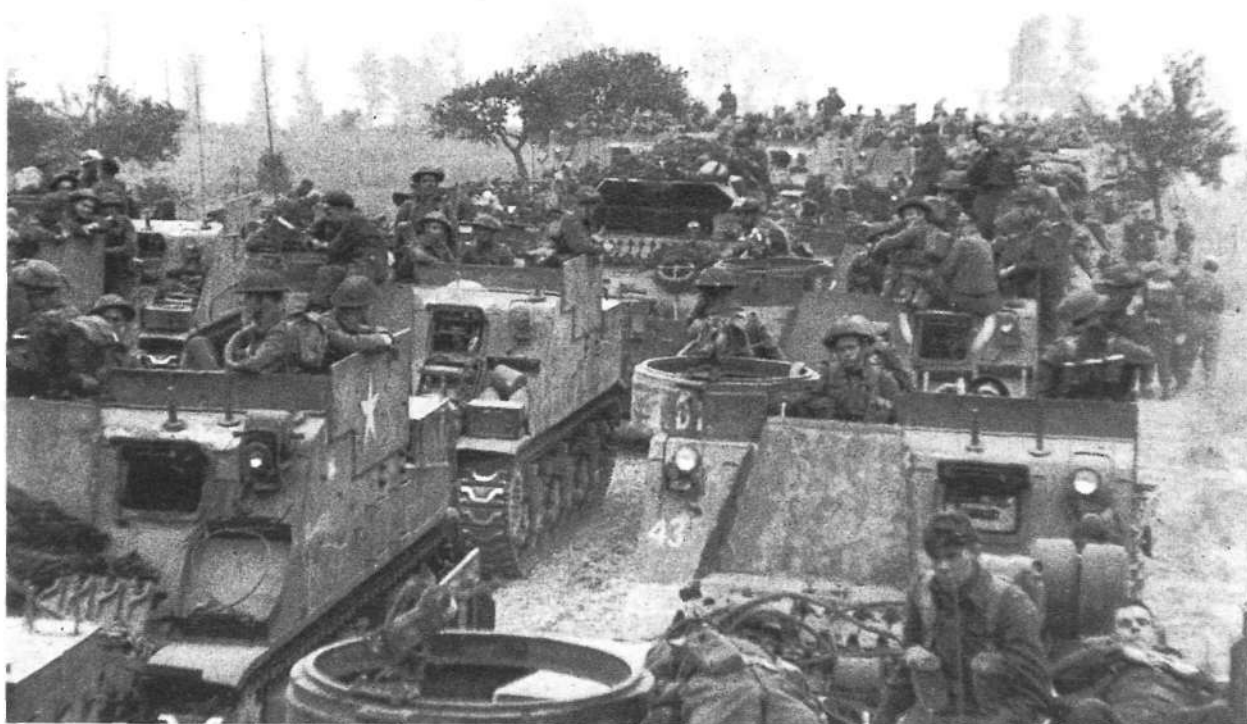
A column of "defrocked Priests" carrying troops of the 4th Canadian Infantry Brigade line up in preparation for Operation "Totalize," 7 August 1944.

"AWD Kangaroo" established itself in two fields near Bayeux on 2 August. By that evening 14 vehicles had been stripped. Armour plate was obtained from a "help-yourself" park of "W" Crocks (tanks beyond repair); mild plate was found south of Caen and also cut from landing craft stranded on the Normandy beaches. Although a work schedule had been made, most of the maintainers found themselves working around the clock. By 2000 hours on 5 August, 72 carriers had been completed and six more were ready by noon on the 6th, 5 although Stacey states that a total of 76 were ready by the 6th. 6