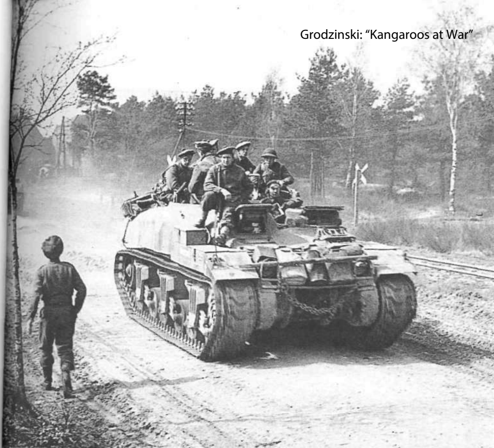
Ram Kangaroos in Action.

Left: Soldiers of the Argyll and Sutherland Highlanders being rushed forward in convoys of Kangaroos, 11 April 1945.